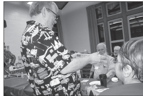
My lucky day!