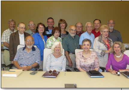
The 2015-2016 AUAR Board

The AUAR Newsletter is a biannual publication of the Association of The University of Akron Retirees (AUAR), c/o Talent Development & Human Relations Department, The University of Akron, Akron, OH 44325-4730.