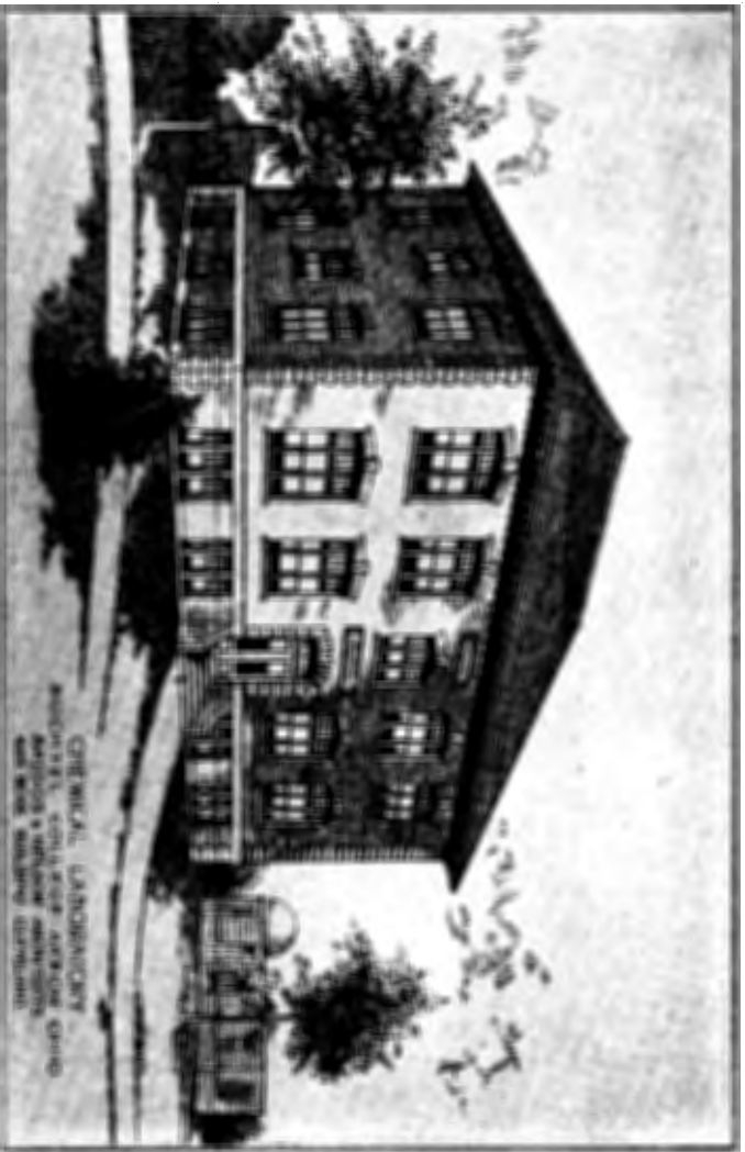
PHYSICIAN'S CONSULTING OFFICE AND MEDICAL LABORATORY