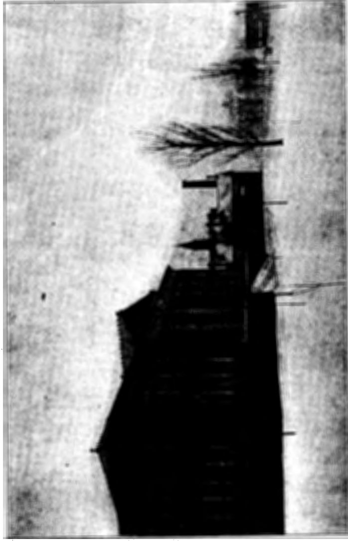
BUCHTEL COLLEGE CAMPUS.